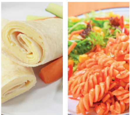
Deli Choice of Breads with a Selection of Fillings served with a Side Salad or Pasta of the Day

JACKET POTATO WITH A SELECTION OF FILLINGS SERVED WITH A SIDE SALAD