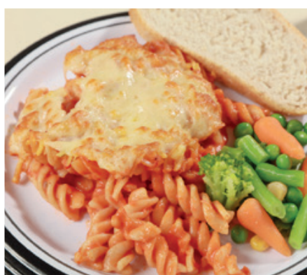
3 Cheese & Tomato Pasta (V) served with Crusty Bread & Seasonal Vegetables