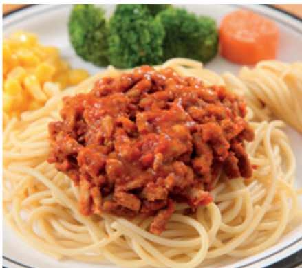
Spaghetti Bolognese served with Seasonal Vegetables