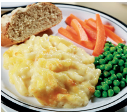
Mac 'n' Cheese (V) served with Crusty Bread & Seasonal Vegetables