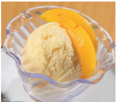
Vanilla Ice Cream & Fruit