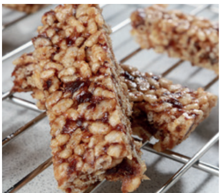
Caramel Crispy Bar