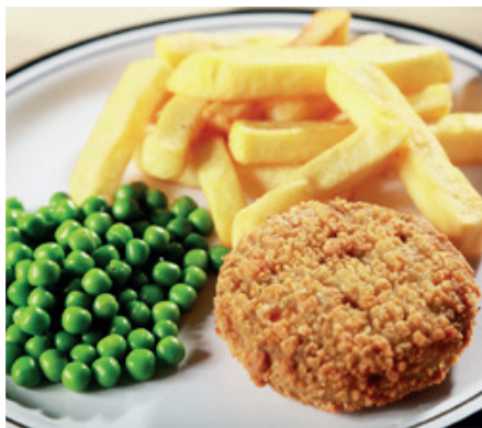
Fishcake served with Chips, Baked Beans or Peas