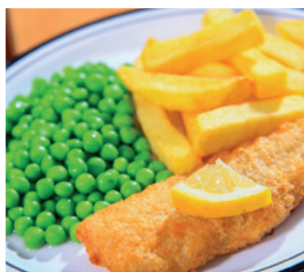
Battered Fish served with Chips, Baked Beans or Peas