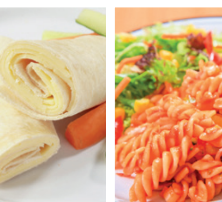
Deli Choice of Breads with a Selection of Fillings served with a Side Salad or Pasta of the Day