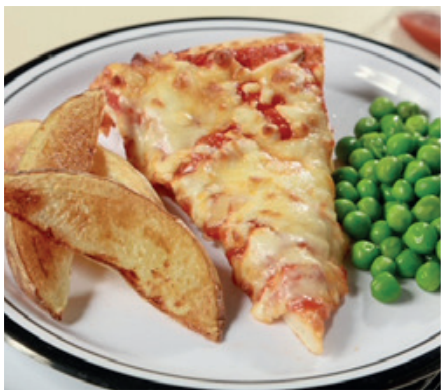
Thin & Crispy Margherita Pizza (V) served with Potato Wedges, Baked Beans, Seasonal Vegetables or Coleslaw