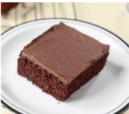
Iced Wacky Chocolate Cake