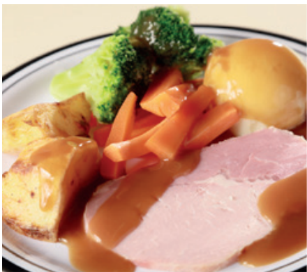
Roast Gammon Lunch served Roast/Mashed Potatoes, Seasonal Vegetables & Gravy