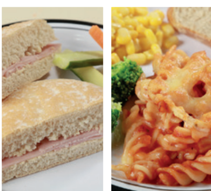
Deli Choice of Breads with a Selection of Fillings served with a Side Salad or Pasta of the Day