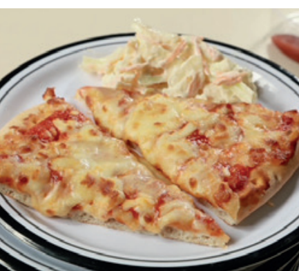
2 Slices of Margherita Pizza (V) served with Baked Beans, Seasonal Vegetables or Coleslaw