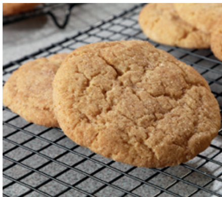
Snicker Doodle Biscuit