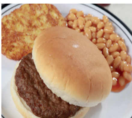
Beef Burger in a Bun, Hash Brown served with Baked Beans or Seasonal Vegetables