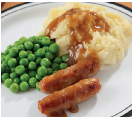
Sausages served with Mashed Potato, Gravy & Seasonal Vegetables