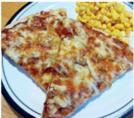
2 Slices of Texas BBQ Pizza (V) served with Baked Beans, Seasonal Vegetables or Coleslaw