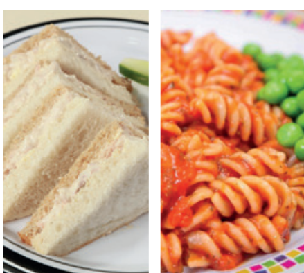
Deli Choice of Breads with a Selection of Fillings served with a Side Salad or Pasta of the Day