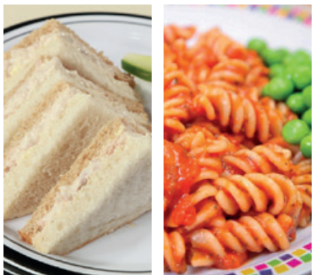
Deli Choice of Breads with a Selection of Fillings served with a Side Salad or Pasta of the Day