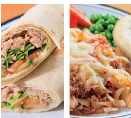
Deli Choice of Breads with a Selection of Fillings served with a Side Salad or Pasta of the Day