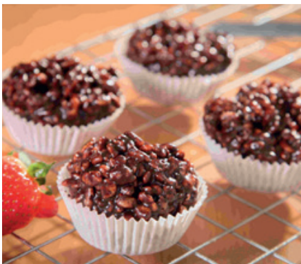
Chocolate Crispy Cake