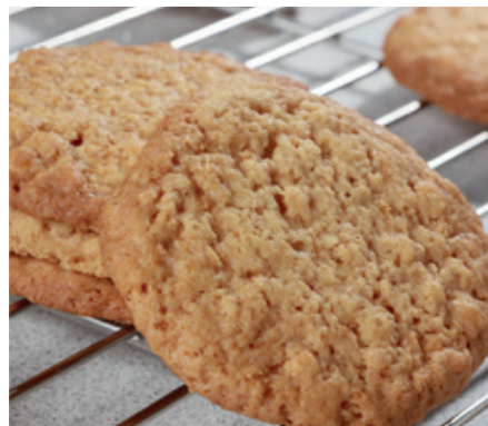
Rice Crispy Cookie

For allergen information, please ask one of our catering team • All the above dishes are subject to availability