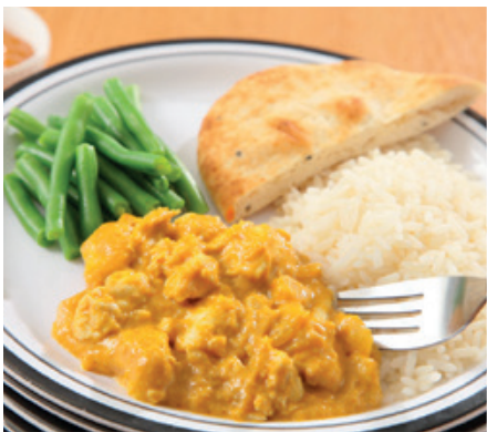
Mild Chicken Curry served with Rice, Naan Bread & Seasonal Vegetables