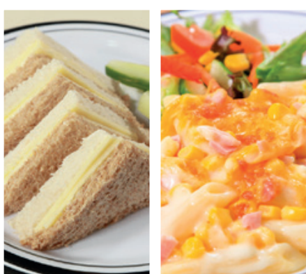
Deli Choice of Breads with a Selection of Fillings served with a Side Salad or Pasta of the Day