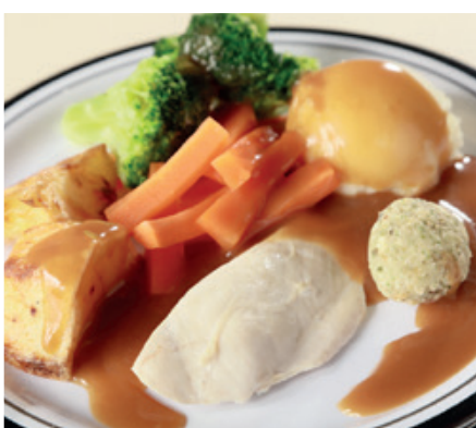
Roast Chicken Lunch served Roast/Mashed Potatoes, Seasonal Vegetables & Gravy