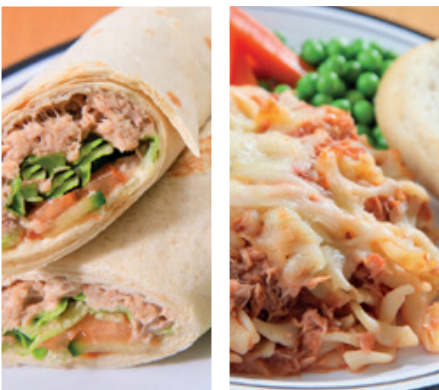
Deli Choice of Breads with a Selection of Fillings served with a Side Salad or Pasta of the Day