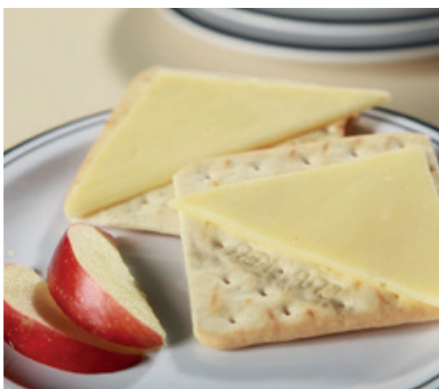
Cheese & Crackers