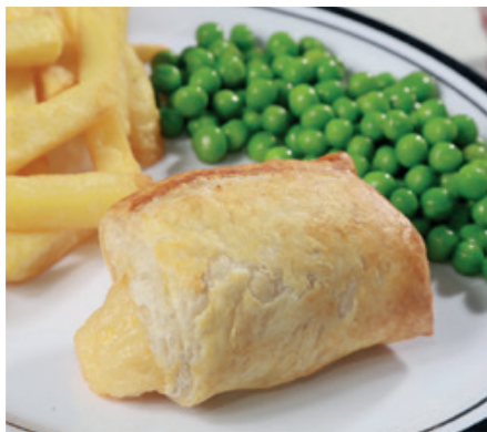
Oven Baked Cheddar Cheese & Onion Roll (V) served with Chips, Baked Beans or Peas