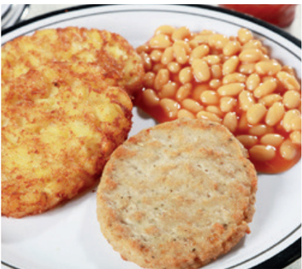
Sausage Pattie Brunch served with Hash Browns & Baked Beans