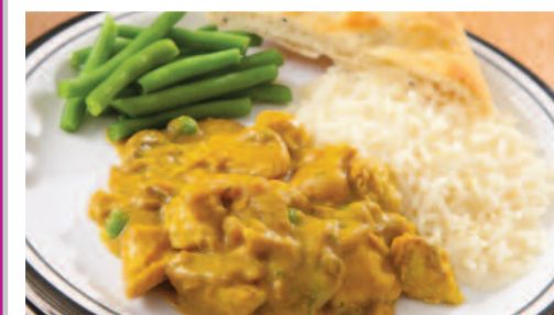
Chinese Chicken Curry served with Rice, Naan Bread & Seasonal Vegetables