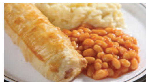
Homemade Sausage Roll served with Mashed Potato & Baked Beans