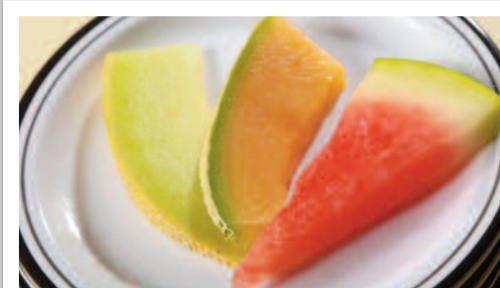
Trio of Melon