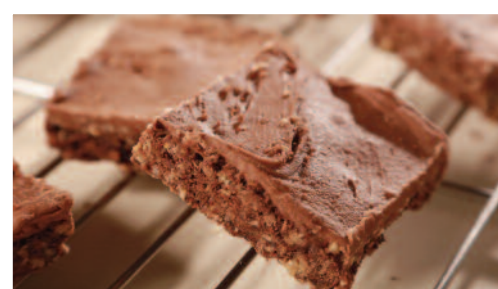
Iced Chocolate Oaty Square