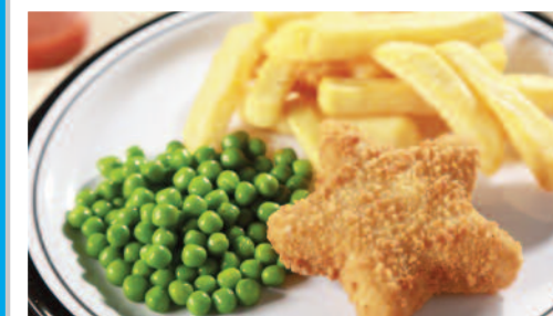
Fish Star (MSC) served with Chips & Peas or Baked Beans

VEGETARIAN VERSIONS OF THE ABOVE MEAL AVAILABLE DAILY