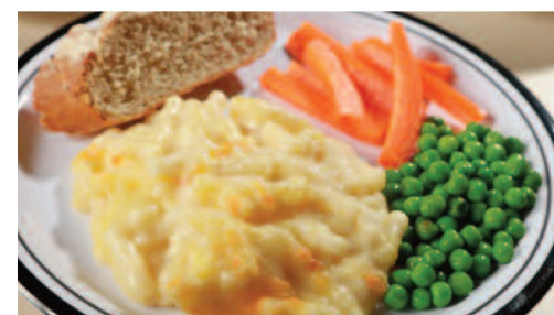
Mac 'n' Cheese served with Garlic & Herb Bread and Seasonal Vegetables