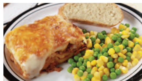
Beef Lasagne served with Garlic & Herb Bread and Seasonal Vegetables