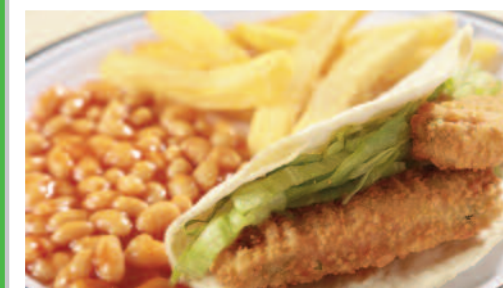
Fish Finger (MSC) Taco served with Chips & Peas or Baked Beans

VEGETARIAN VERSIONS OF THE ABOVE MEAL AVAILABLE DAILY