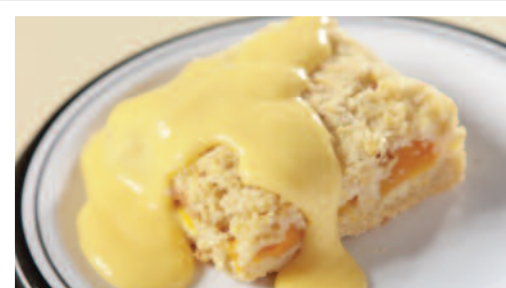
Peach Crumble Slice & Custard